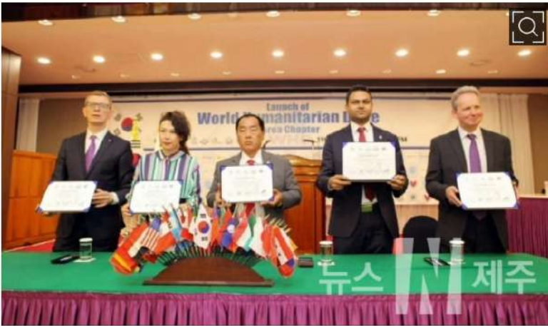
세계인도주의의 날 지난 19일, 제주도 오리엔탈호텔에서 WHD KOREA 런칭 기념식이 개최됐다.

"전인류의 평화, 교육, 조화 증진시키기 위한 무역을 위한 협약서 서명"